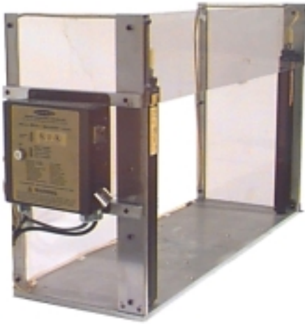
Light Curtain System