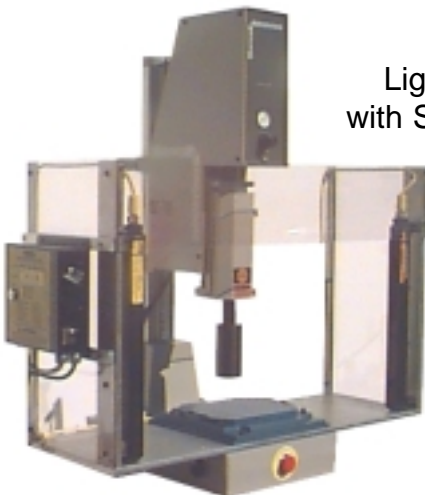
Light Curtain with Sonic Welder

AFM Engineering, Inc. has made installation easy. The system comes standard with mounting holes for most popular Hot Stamping Machines and Ultrasonic Welding Machines. All you need to do is bolt down the system. Electrically it will be wired to replace your palm buttons so all you need to do is unplug your current palm buttons and plug in the light curtain. It couldn't be any easier!